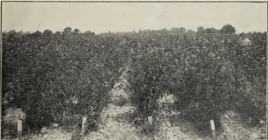
This is one block of about 60,000 Peach Trees coming 1 year from buds. Note excellent growth. Photographed July 10, 1924.

I wish to call your special attention to the fact that every one of our large stock of peach trees are budded on Kansas and North Carolina Natural seedlings, the most hardy in the U. S. You cannot afford to overlook this important feature. Our trees are well grown, smooth and well rooted. Our prices are low, considering the quality. Let us have your order at once that we may reserve the varieties for you. Notice about time of Ripening for Westminster, Md.